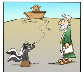
Don't tell me you lost our boarding pass. THAT STINKS!