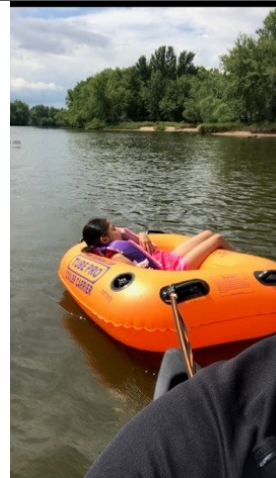
district tubing adventure