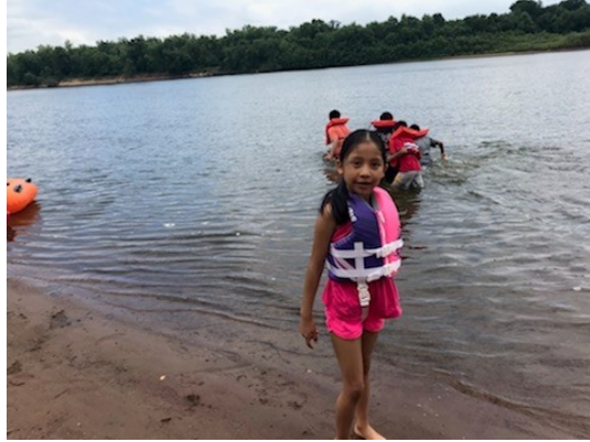
district tubing adventure on Wisconsin River