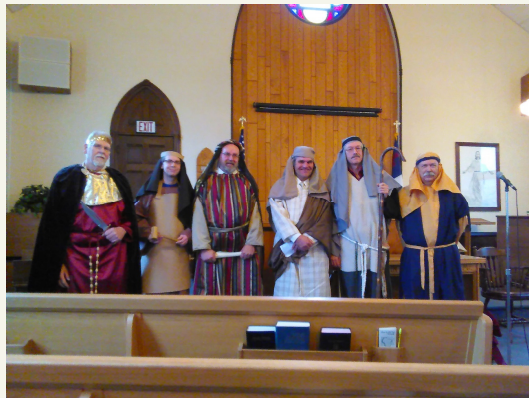
Almond Church - Christmas Program

As part of our Christmas program, along with some beautiful music, we viewed Bethlehem through the eyes of six men that lived the story first hand. They allowed us to put ourselves back in time and really experience the story giving us new insights into the plan of redemption.