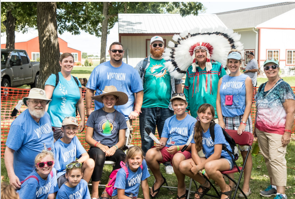
PATHFINDERS FROM THE PORTAGE CHURCH AT THE BIG CAMPOREE IN OSHKOSH HELD ON THE EAA GROUNDS