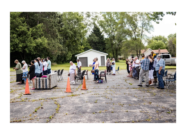
Another view of some of our group